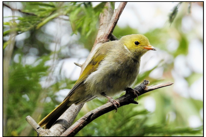
White-plumed Honeyeater