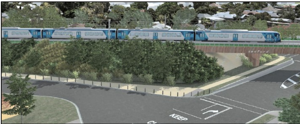
Road under – Rail over option at Seaford Road

Given the trench option at Edithvale and the proximity of the wetlands to the Seaford crossing, FESWI believes that there is absolutely no option but for both crossings to be referred to the federal government for an Environmental Impact Statement.