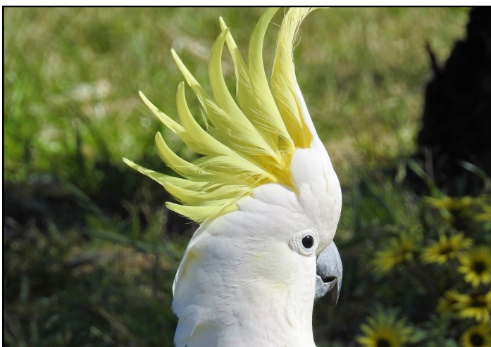
Sulphur-crested Cockatoo