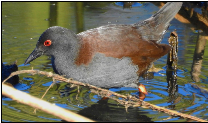
Spotless Crake