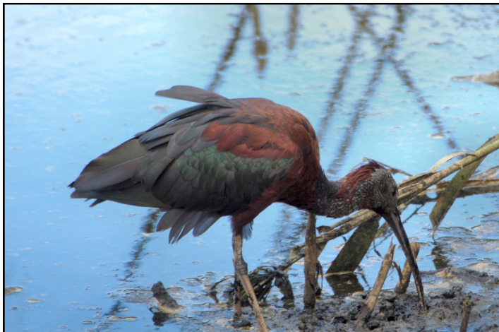
Glossy Ibis