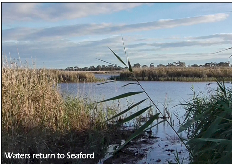
Waters return to Seaford