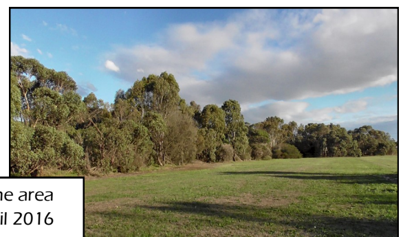
Same area April 2016