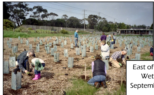
East of Seaford Wetlands September 2001

In the past there have been many thousands of plantings too around Edithvale Wetlands. We are hoping to re-introduce Working Bees there. Just waiting on Kingston Council.