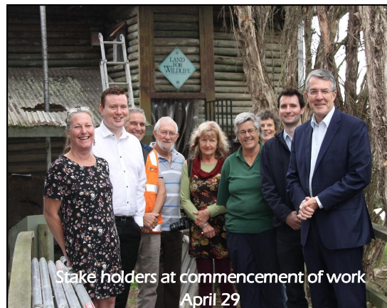
Stake holders at commencement of work April 29