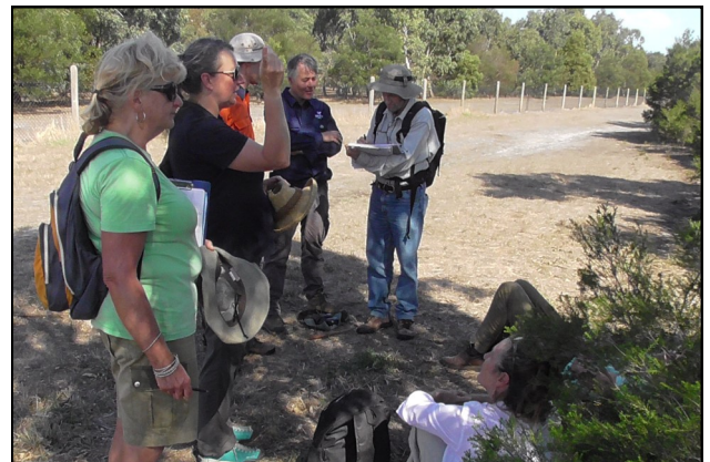
Taking a break at Seaford Wetlands

FESWI was represented at two meetings - 8 th March at the Education Centre, and one on 16 th March - all day at Edithvale and Seaford Wetlands in turn. Their purpose was to check that our wetlands still meet the requirements for a Ramsar listing (which they do!).