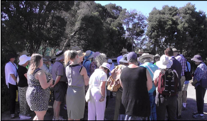
Walking group set to enter Edithvale Wetlands.

FESWI conducted a walk around Edithvale South to mark this day (2 nd February). It was very well attended although the kangaroos didn't fulfil their part very well. Not many to be seen.