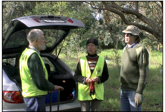
Working Bee restarted in February at Seaford Wetlands (1st Sunday of each month)