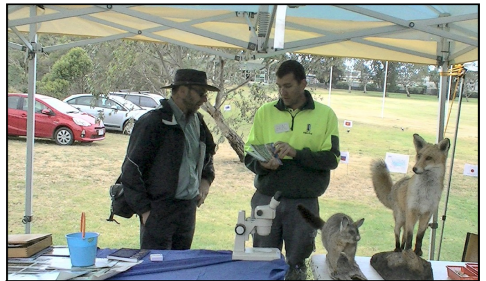
Representatives from the City of Kingston and Coast Care provide great displays.