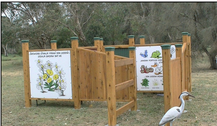
FESWI's maze to encourage children to learn about, and become involved with plants.