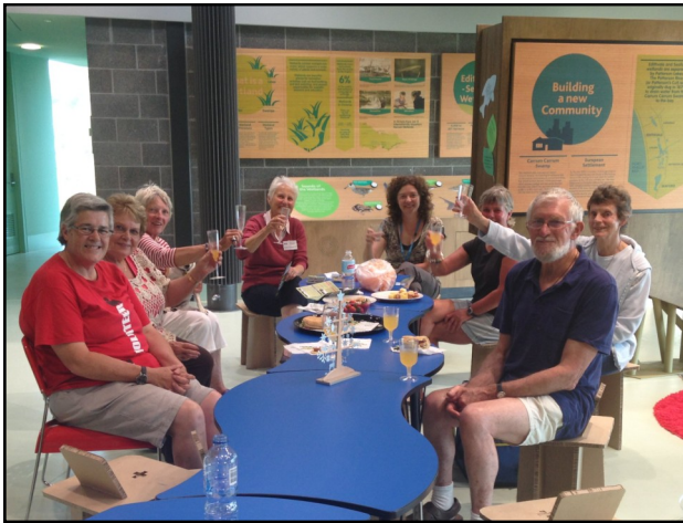
Discovery Centre volunteers get together at a Christmas Party (2nd & 4th Sundays/month)