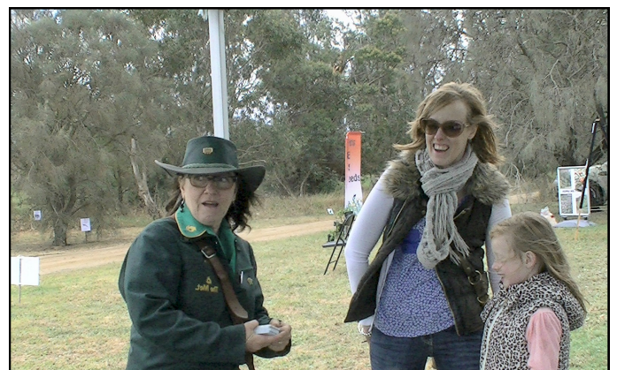
The 'Tram Conductor' providing bird information and picture cards to children.