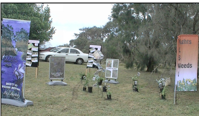
Plant display suggesting what to replace weed plants with.