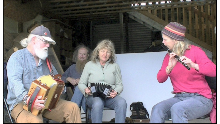
Musicians provide ambient music.